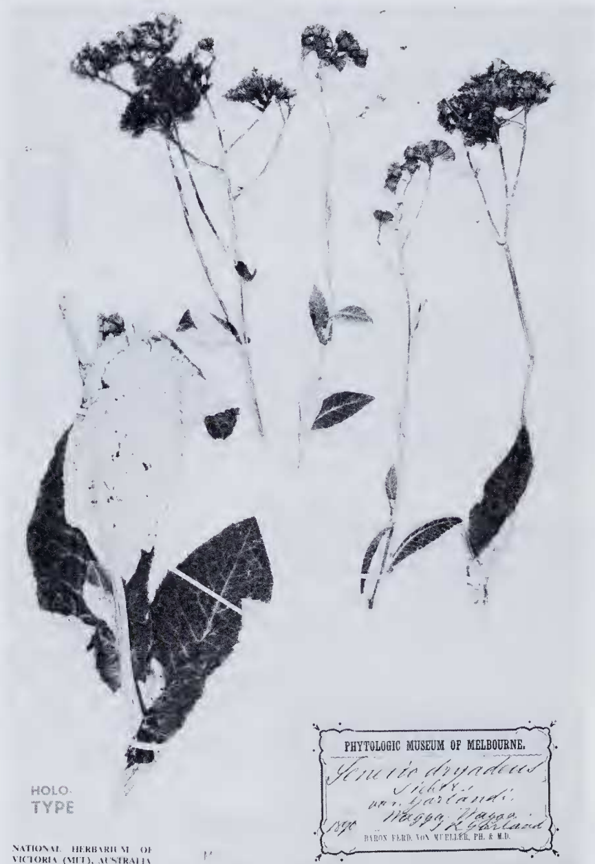
Fig. 1. Senecio garlandii . Holotype ( Garland s.n. , MEL 666712).

Achenes light brown, 2 mm long, with short hairs glabrescent in narrow grooves. Pappus bristles slender, uniform, not persistent.